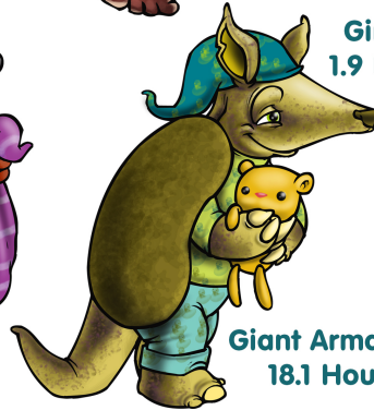
Giant Armadillo 18.1 Hours