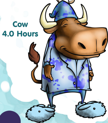
Cow 4.0 Hours