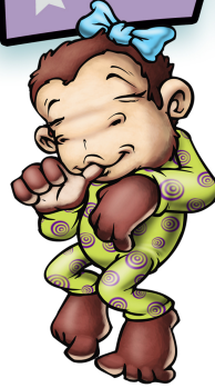
Brown Bat 19.9 Hours Chimpanzee 9.7 Hours