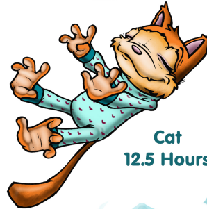
Cat 12.5 Hours

All animals (including YOU!) need sleep to be healthy. How much sleep do you need?