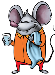
House Mouse 12.5 Hours