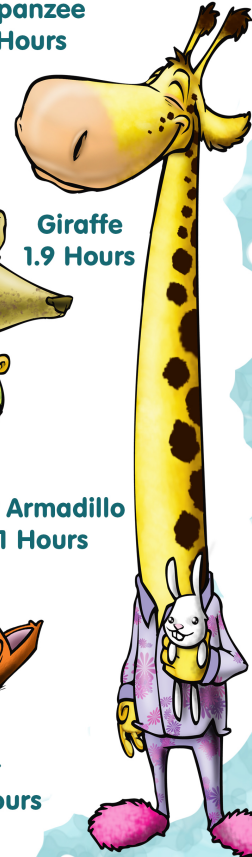
Giraffe 1.9 Hours