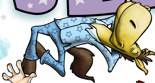
Horse 2.9 Hours