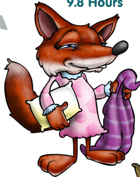
Red Fox 9.8 Hours