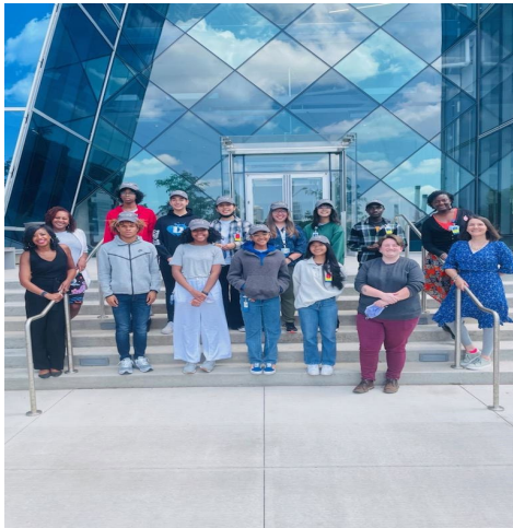
Star 2.0 students, physician mentors, and teachers

PLUS , the program provides a stipend ($2,600) to attend, which allows students to participate who were planning to work over summer break.