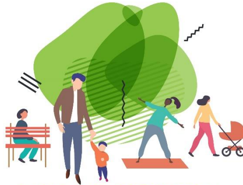
PARKS AND RECREATION