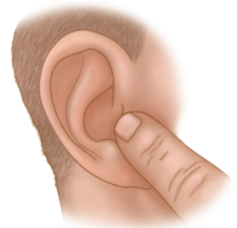
Pumping the tragus