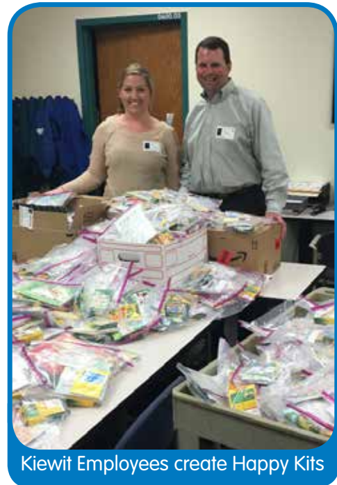
Kiewit Employees create Happy Kits

Happy Kits can be assembled off-site and delivered to Volunteer and Guest Services at the Children's Mercy Adele Hall Campus (downtown hospital). Once you are ready to deliver your Happy Kits, please use our online scheduling form available at www.childrensmercy.org/help-our-kids/donate-goods or call 816-234-3496.