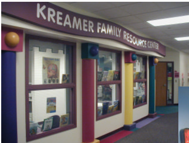
Kreamer Family Resource Center